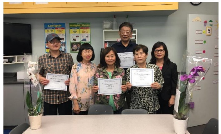
Spring 2019 Pathway to Citizenship Graduates

Serving the immigrant population and communities is our goal. We continued to open our citizenship class to the community, which was led by our two devoted and experienced volunteer teachers. This past spring, 12 students enrolled in our class, of which 4 completed all 12 sessions. Many immigrants could not make it because of their work schedule and family matters. Our volunteer teachers not only helped students for their successful pathway of citizenship, but also cheered them on to aspire for more.