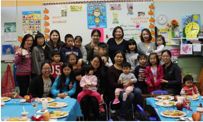
Fall 2019 Parent Essentials Saturday Cohort

the Boston education system, equipping them with skills and confidence to advocate for their children, and attendance itself!