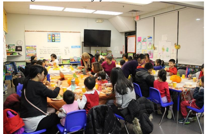
Families enjoying a “Taste of Thanksgiving”

For the first time, we opened our Taste of Thanksgiving event to the families. Traditionally, this event was for our students only, to give them an idea of what an American Thanksgiving meal would look and taste like. Year after year, our students love this experience. To give this same experience to our families, we invited them to come and partake in this meal together. It was a joyous time!