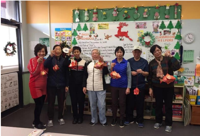
Art and Crafts for Elders Class

In 2018, we started a fitness and soft stretching class for Tai Tung Village senior residents. We had 9-10 regular students attending this class twice a week for 6 months. Our staff and volunteers also provided free art and crafts classes for seniors living in Tai Tung Village. We had 5-8 participants who attended 6 art sessions. They enjoyed creating with winter and holiday art, Chinese paper art, and calligraphy. Our expanded services to elders helped them to improve their physical mobility and mental and emotional health. We are looking for grants to continue our program for elders in the coming year.