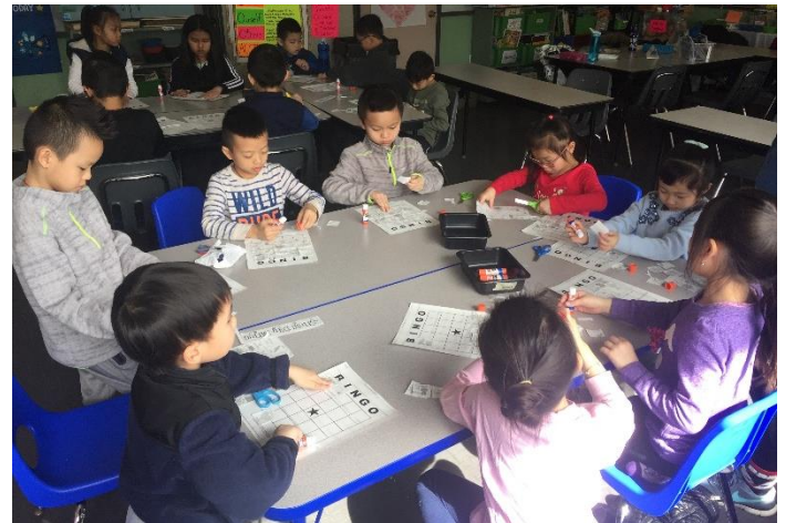
ASEP students sitting in our new low-height tables

And perhaps what was most exciting for the 2017-2018 year was the ability to offer significant scholarships to many of our families for the first time in years. Part of the Chinatown Trust Fund grants was dedicated to reducing the financial burdens for our families, majority of whom are low-income. About 26 families were awarded scholarships of at least $200-$300 per student for ASEP, significantly reducing the financial stress for each family.