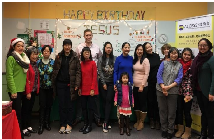
Volunteers for 2017 Christmas Tree Lighting