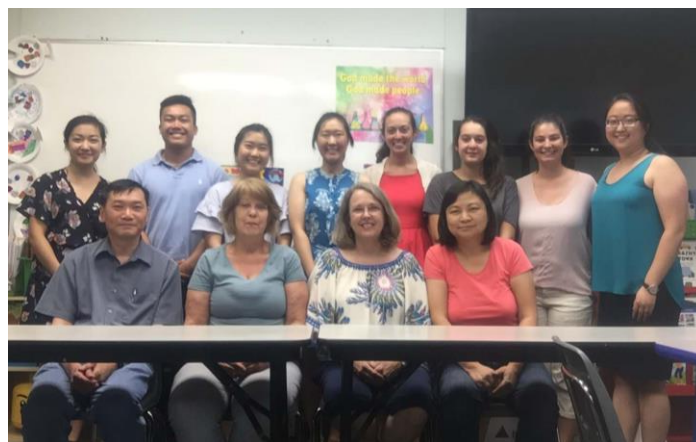
2018 SEP Teachers & Staff

Thank You to All Our Staff, Partners & Volunteers!