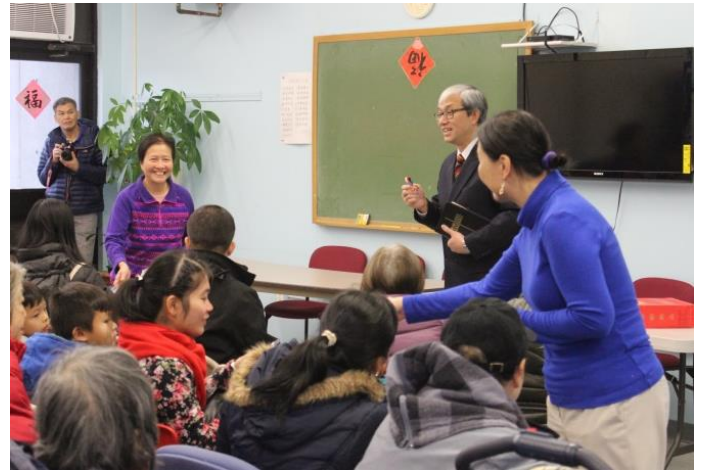
ACCESS families and Tai Tung residents listening to the Good News of Jesus

gospel outreach. The message of peace, joy, and hope, with all the lights and decorations created a beautiful and uplifting atmosphere in Tai Tung Village.