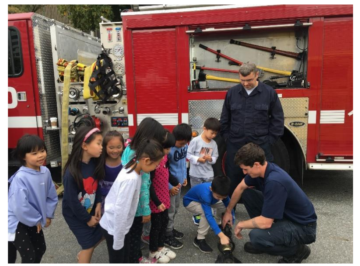
Fire Fighters' visitation from Boston Fire Department

2020 Virtual Summer Enrichment Program (SEP) Knowing the dangers and difficulty of reopening our site for in-person care, we decided to move our Summer Enrichment Program online. Using Zoom and advanced planning by the summer teachers, we were able to conduct 9 weeks of classes and clubs for a total of 30 students. The summer was split into 3 sessions of 3 weeks each, allowing families more flexibility to enroll their children into however many sessions they needed. And, by starting the summer teacher training and preparation earlier, we were able to put together boxes of worksheets, activity sheets, arts and crafts supplies, and school supplies for each student for each session. It was a tremendous feat that I believe set our summer program apart.