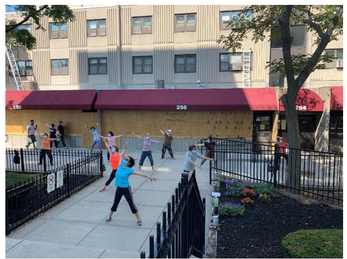
2020 Fitness Class for Tai Tung Senior Residents

ACCESS also provided work and training opportunities for young professionals and youth to cultivate them to enter early childhood education, learn about community service, explore Christian faith, and develop more potential skills. We are so graceful that God placed ACCESS in Chinatown not only serve the immigration population, but also use ACCESS as a practical training platform for Christians to exercise their faith, build Jesuslike character, practice vocational mission and act as change agents.